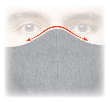
Contoured fit for more comfortable feel and better fit around the nose